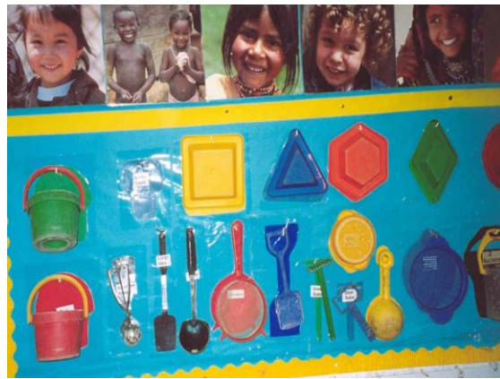
Silhouettes to help children to put resources away while promoting shape matching...