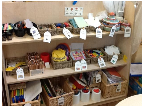
Using labels with picture and word to support children to self-select and tidy up...