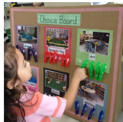
Children can choose from continuous/enhanced provision