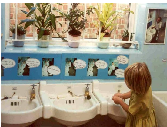
Children follow instructions when washing hands...