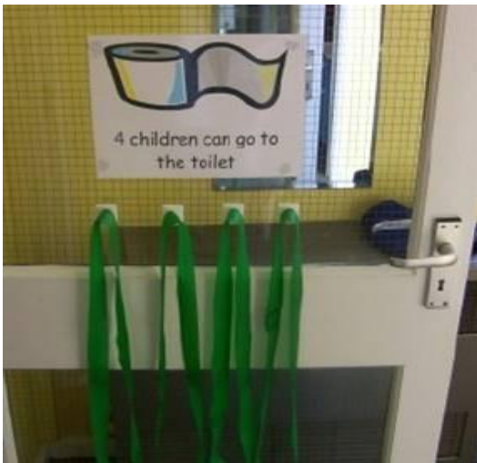
Children wear a band to go to the toilet...